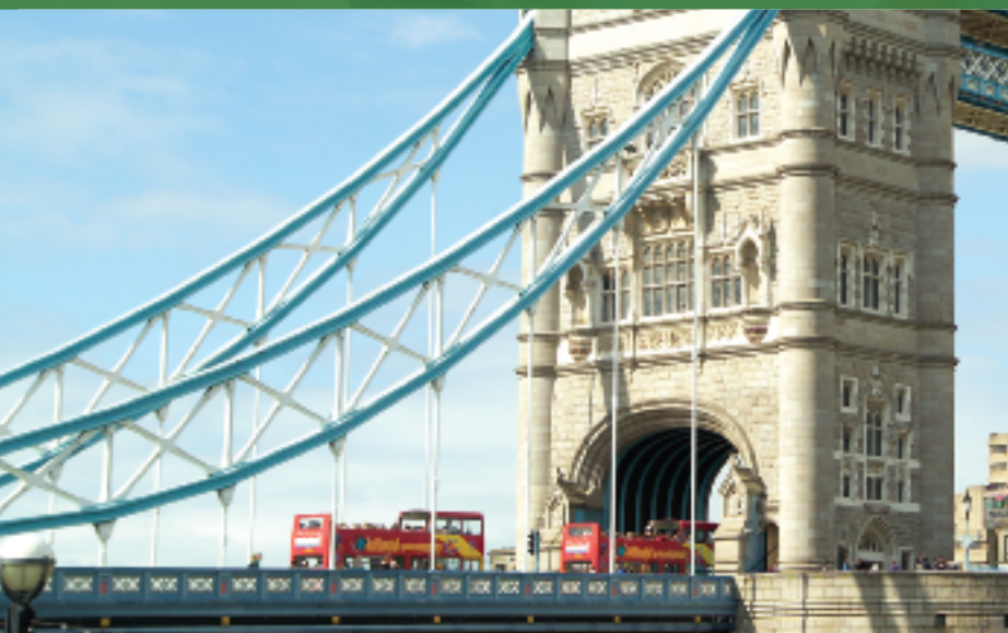
Tower Bridge London, England