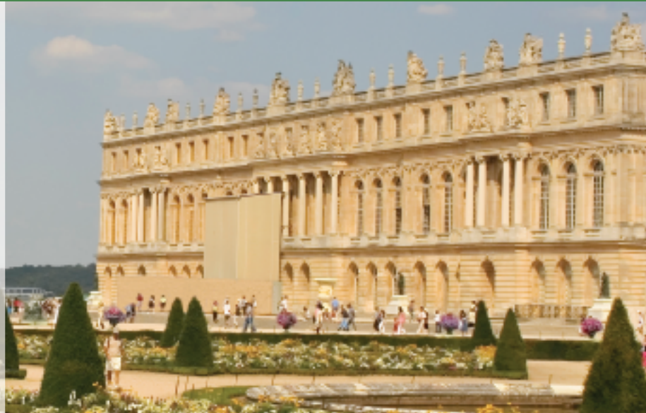
Versailles Palace Versailles, France

Nobody does decadence like Louis XIV, and there's no better testament to this than Versailles. Under the direction of the Sun King, the château that began as a modest hunting lodge exploded into one of the largest palaces on earth. On your excursion to this lavish estate, explore the state apartments of the king and queen and the magnificent Hall of Mirrors. Walk through the meticulously landscaped gardens and marvel at dozens of ornate fountains. Discover why Versailles was more than just a vacation home: Louis XIV hosted his royal court here to rein in their power and prevent their political rise.