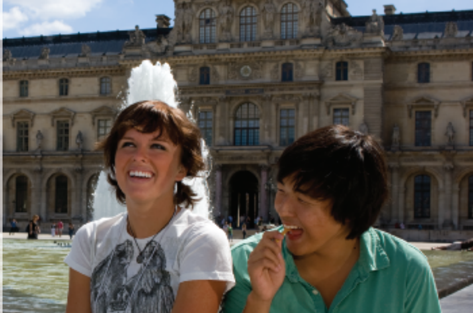
Louvre Paris, France

Bonjour, Paris! During your sightseeing in the City of Light, get a taste of Parisian style as you ride down the Champs-Élysées, an elegant boulevard packed with high-fashion boutiques. Pass the Place de la Concorde and the Arc de Triomphe and strike a pose in front of the Eiffel Tower. At the École Militaire, see where a promising young Napoleon launched his rise to power. I.M. Pei's iconic glass pyramid marks the entrance to the renowned Louvre, home to treasures like Leonardo da Vinci's Mona Lisa . Then, travel to the Notre Dame Cathedral and admire its sculptured façade, stained-glass rose windows and seemingly weightless vaulted ceilings.